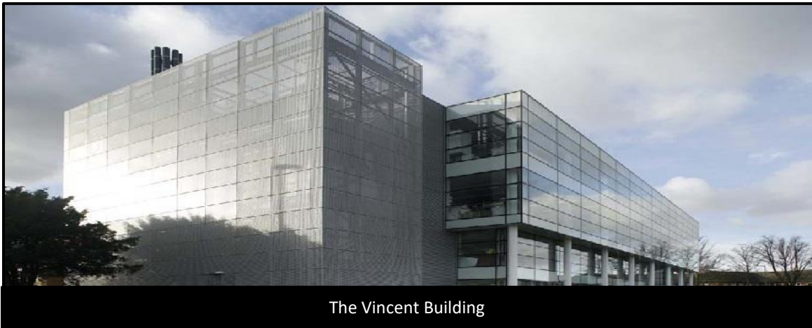
The Vincent Building

The venue for ASEC 2018 will be The Vincent Building, Central Avenue, Cranfield University, Cranfield, MK43 0JR.